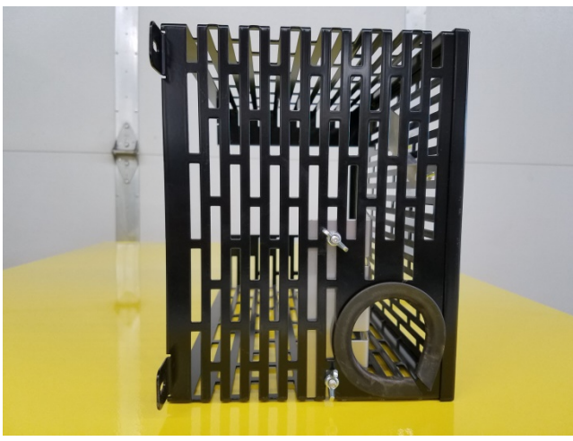
Both Hose Guide and Hose Guard attached